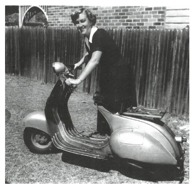
First WA female scooter driver licence holder – 3 April 1957 – guess who?

A well-respected past-President of the West Coast Bridge Club achieved fame in 1957 as the first female scooter driver licence holder in Western Australia. In the interests of propriety her name has been suppressed.